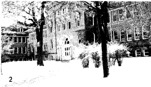
Front Entrance, Main Building

CENTRAL STATE TEACHERS COLLEGE Stevens Point, Wisconsin